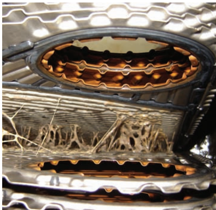
Severe biofouling of flat-plate heat exchangers can reduce efficiency to near zero.

Table 4 is another table made for the same farm and same sys-