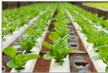
Nutrient Film Technique (NFT)

Optimal water temperature equals optimal growth. When temperatures are accurately set and maintained for Aquaponic applications, the result is increased production yields, improved product quality and extended shelf life.