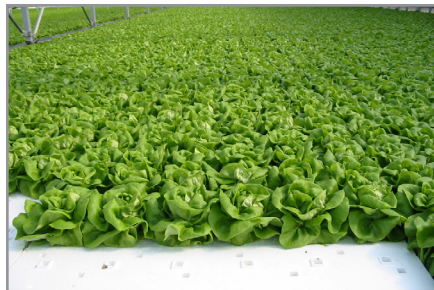
Floating Raft System